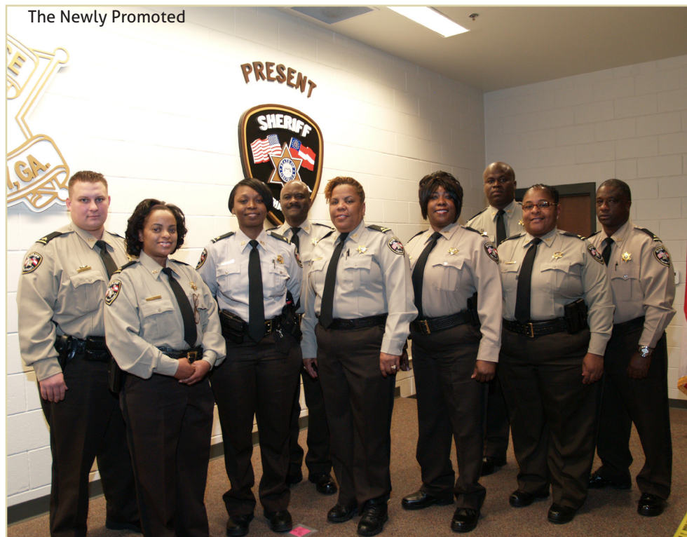
The Newly Promoted