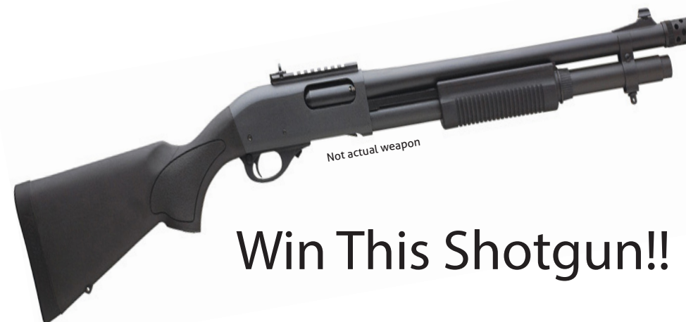
Not actual weapon

The mission of the Chatham County Sheriff's Office Explorer Post is to educate young men and women who are interested in a career in the law enforcement field and to enhance their future by mentoring, motivating and preparing them for their roles as productive citizens in the Coastal Empire.